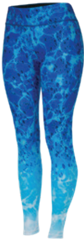
BLUE 2041211000 | BLU