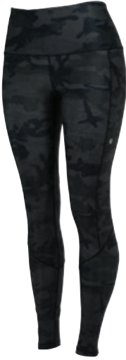
BLACK 2041202001 | BLK