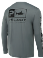
GREY 3015213000 | GRY