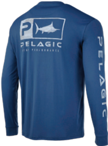
SMOKEY BLUE 3015202000 | SMB