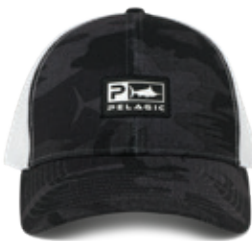
BLACK 1203202000 | BLK