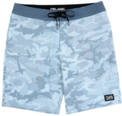
SLATE CAMO 1001211001 | SLT