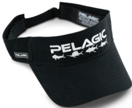
BLACK 1207201000 | BLK