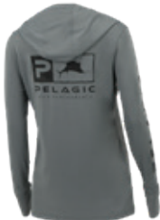
GREY 2015213000 | GRY