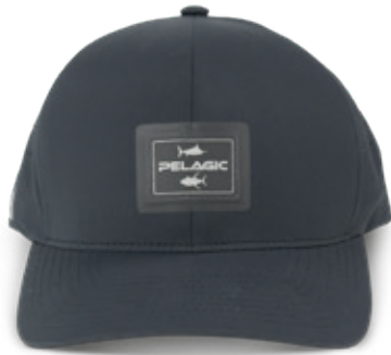
BLACK 1201201000 | BLK