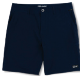
NAVY 1001213002 | NVY