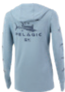
SMOKEY BLUE 2015211005 | SMB