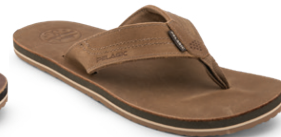
TAN 1401181001 | TAN