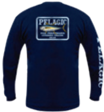
NAVY 1173213002 | NVY