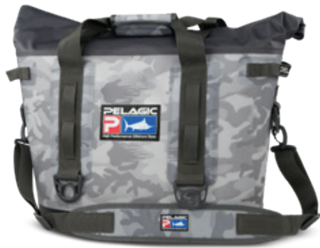
GREY 1278213000 | GRY

Smart Touch - Touchscreen Capable | Kevlar Reinforced | Closed Fingertips for Maximum Protection | Suregrip Technology | Adjustable Velcro Closure