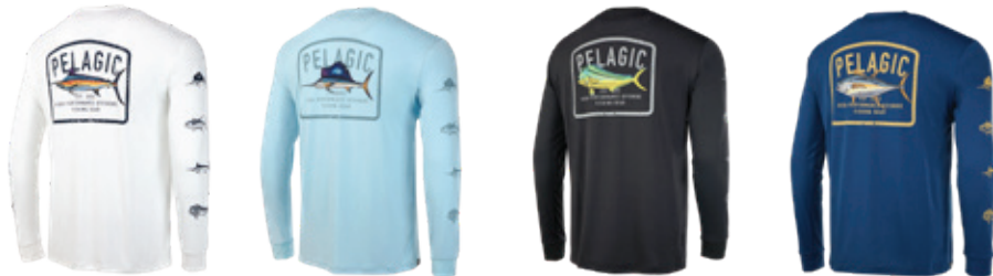
WHITE 1015211000 | WHT