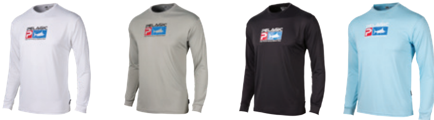
WHITE 1015181021 | WHT