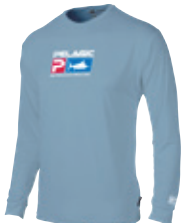
SLATE 3015213002 | SLT