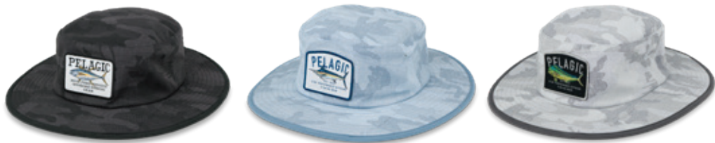
BLACK 1204213000 | BLK