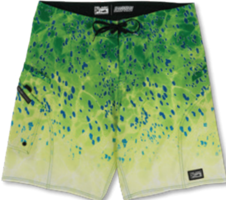
DORADO GREEN 1001211005 | GRN