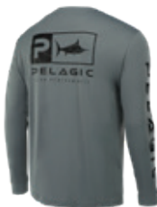
GREY 4015213000 | GRY