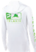
GREEN 2015211006 | GRN