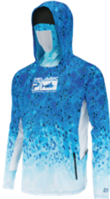
BLUE 3015211009 | BLU