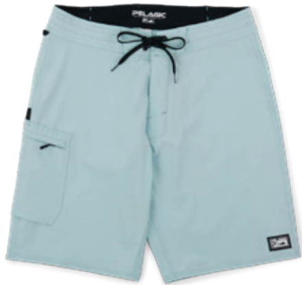
GYOTAKU TURQUOISE 1001211002 | TUR

21” Recycled 4-Way Stretch Fishing Short | 88% Poly | 12% Spandex | Water Repellency And Stain Guard | Tightlines™ Adjustable Waistband | Side Zip Cargo Pocket W/ Reinforced Tool Pocket | Mesh Lined Back Zip Pockets