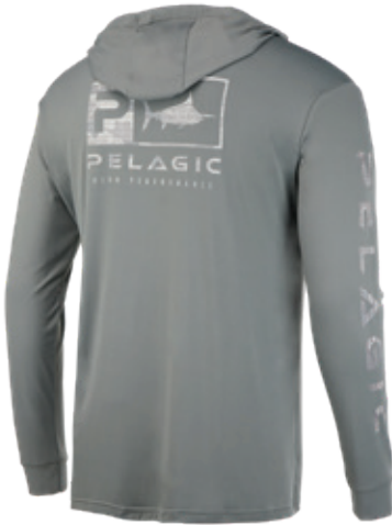
CHARCOAL 3015211002 | CHR