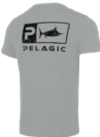
LIGHT GREY 1014213000 | LGY