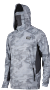
LIGHT GREY 1015202001 | LGY