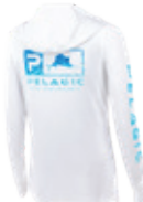
BLUE 2015211006 | BLU