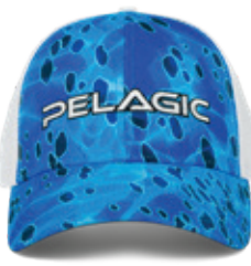
BLUE 1203213000 | BLU