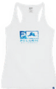
WHITE 2010213000 | WHT