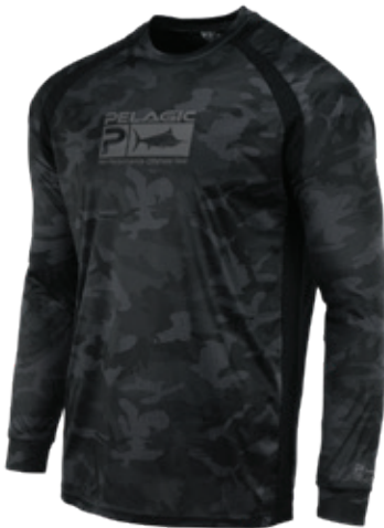
BLACK 4015213003 | BLK