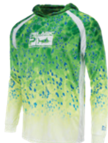
GREEN 1015213004 | GRN

Beat the heat! Built of a lightweight and ultra-comfortable stretch-flex 100% polyester fabric, the VaporTek UPF 50+ Fishing Shirt keeps you cool via full-length, fine-mesh vented panels which allows optimal airflow to pass through the fabric. Offered in a variety of unique sublimated ocean inspired prints, ditch the sunscreen and discover the VaporTek sun protection advantage.