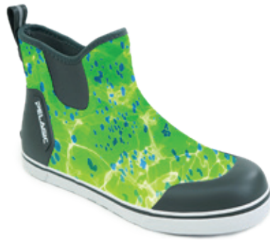
GREEN 1430213000 | GRN

100% Waterproof Rubber | Heavy-Duty Construction with Reinforced Toe | Non-Slip, Non-Marking Boat Sole w/ Aqua-Flow Water | Transport System | Neoprene Side Comfort Gusset | Strap Pull w/ Safety Reflective Strip | Stomp Pad for Easy Boot Removal