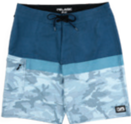
FISH CAMO STACKED - SLATE 1001202001 | SLT