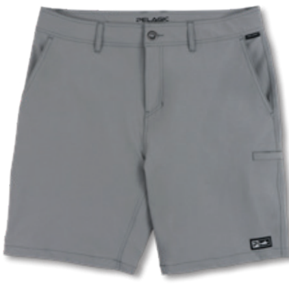
GREY 1001213002 | GRY