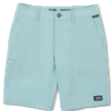
TURQUOISE 3001211004 | TUR