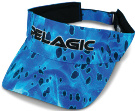
BLUE 1207211000 | BLU