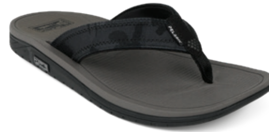
BLACK 1420211000 | BLK

Neoprene Lined Strap | Non-Slip No-Mark Boat Sole | Water Channel Footbed | Ultra-Kushe Padded Footbed