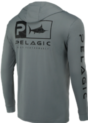
GREY 3015213001 | GRY