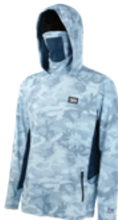
SLATE 1015202001 | SLT