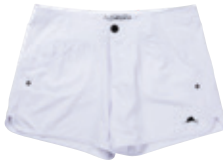
WHITE 2001181005 | WHT

92% Polyester | 8% Elastane | Quick-Drying Fabric | Stain-Re- pel Technology | Hydro-Repel Coating | 4 All-Purpose Pockets