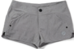
GREY 2001213000 | GRY