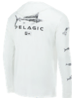
WHITE 1015211005 | WHT