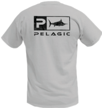
LIGHT GREY 3170213000 | LGY