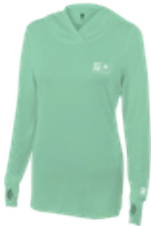
TURQUOISE 2015213010 | TUR