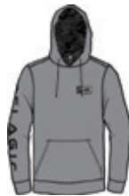
GREY 1061213000 | GRY