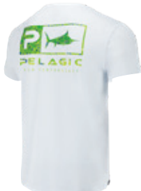
DORADO GREEN 1014211001 | GRN