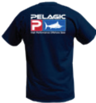
NAVY 3170191002 | NVY