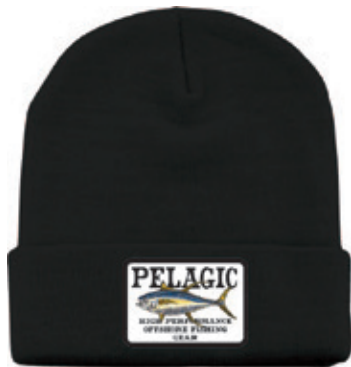
BLACK 1210213000 | BLK