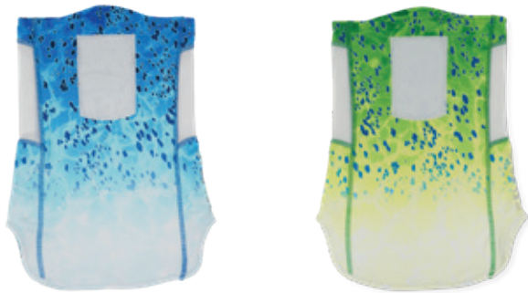
BLUE 1221211000 | BLU