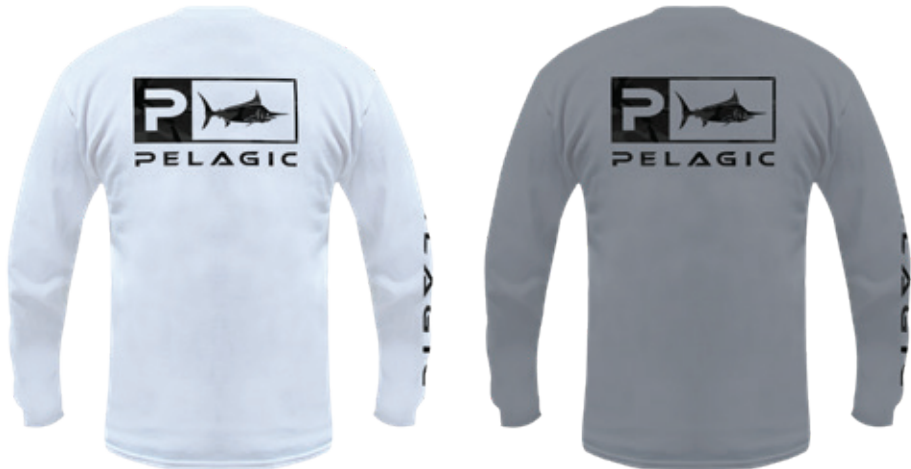
WHITE 1173213001 | WHT