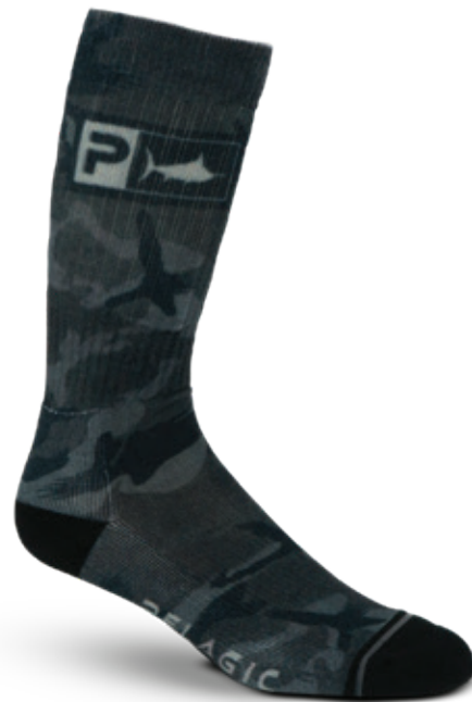
BLACK 1230213000 | BLK