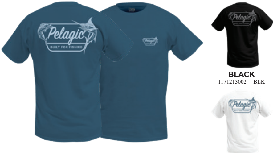
SMOKEY BLUE 1171213002 | SMB