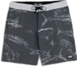
GYOTAKU BLACK 1001211003 | BLK