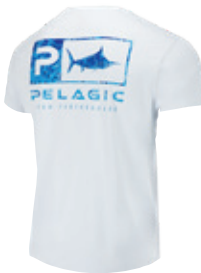
DORADO BLUE 1014211001 | BLU