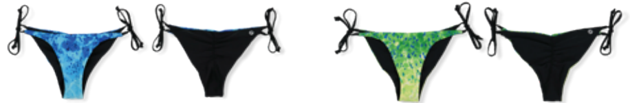
BLUE 2320211001 | BLU