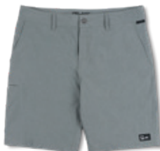
GREY 3001213003 | GRY