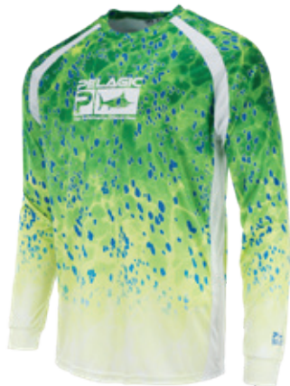
DORADO GREEN 1015211008 | | GRN