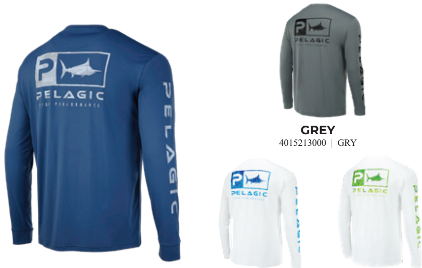
SMOKEY BLUE 4015202000 | SMB