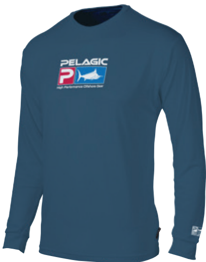
SMOKEY BLUE 3015213002 | SMB