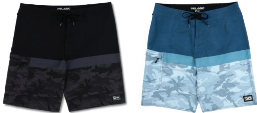
BLACK 4001213000 | BLK