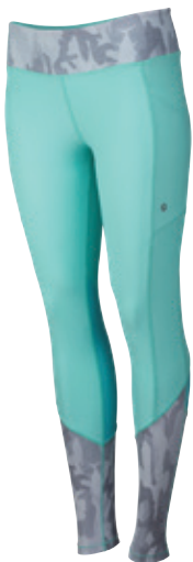
LIGHT GREY 2041202001 | LGY

UPF 50+ Protection | 82% Polyester | 18% Spandex | 3 All-Purpose Pockets | Stain-Repel Technology | Hydro-Repel Coating