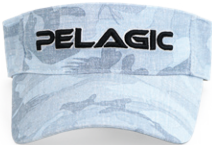
SLATE 1207201003 | SLT