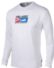
WHITE 3015213002 | WHT