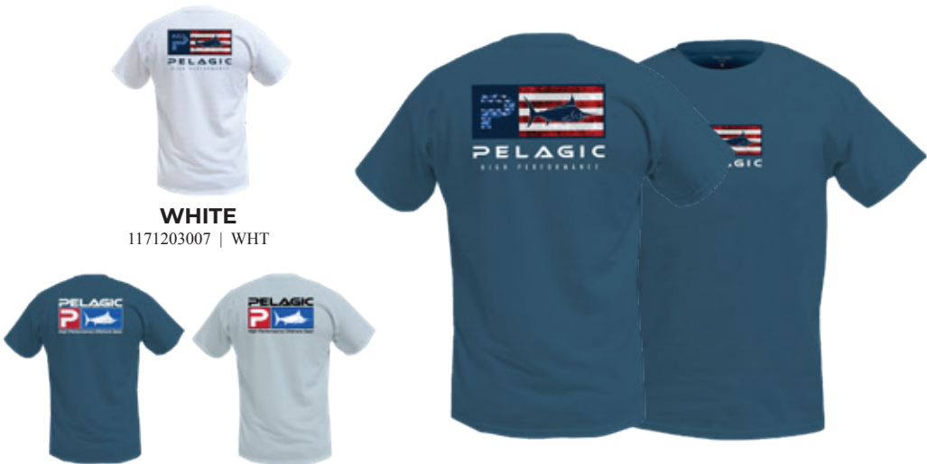
SMOKEY BLUE 1171203013 | SMB