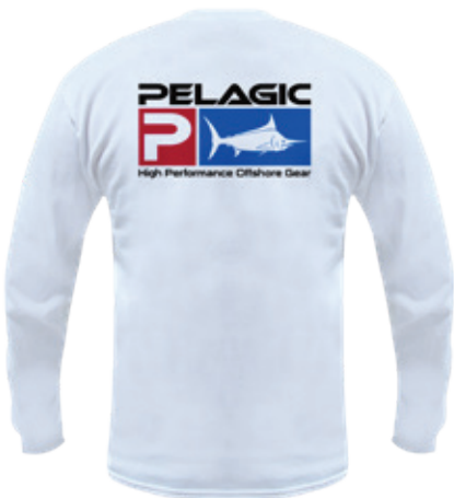
WHITE 1173201001 | WHT