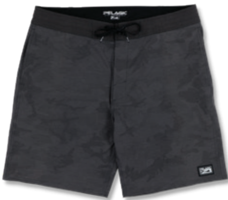
BLACK FISH CAMO 1001211001 | BLK

20” Recycled 4-Way Stretch Fishing Short | 88% Poly | 12% Spandex | Water Repellency And Stain Guard | Tightlines™ Adjustable Waistband | Mesh Lined Back Zip Pockets