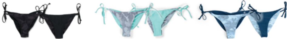
BLACK 2320202001 | BLK