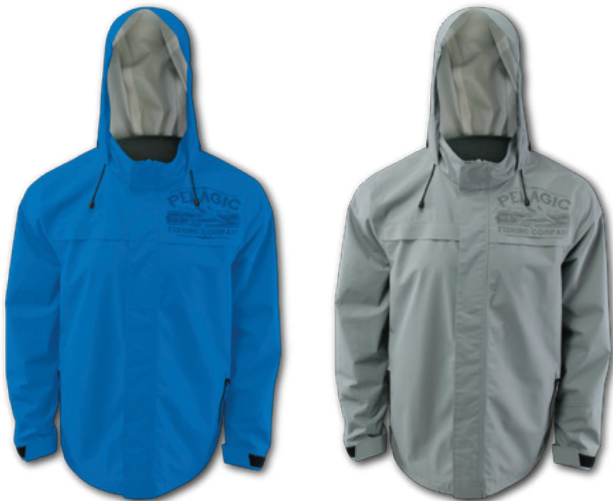
BLUE 1051193000 | BLU