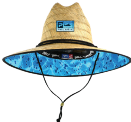
BLUE 1205211000 | BLU