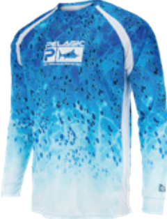
BLUE 3015211008 | BLU