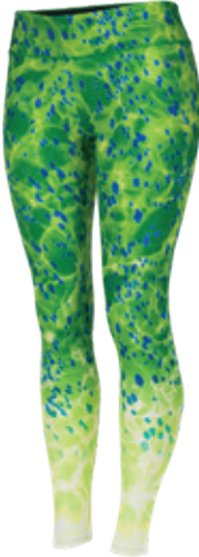
GREEN 2041211000 | GRN

Stretch Flex Fabric | 92% Polyester | 8% Elastane | Quick Dry | 2 All-Purpose Pockets | Stain-Repel Technology