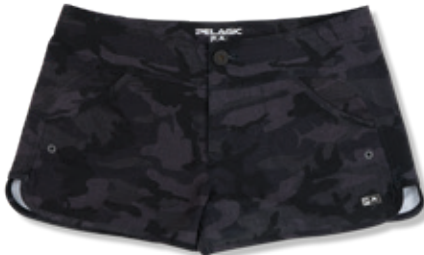
BLACK 2001203000 | BLK

92% Polyester | 8% Elastane | Quick-Drying Fabric | Stain-Re- pel Technology | Hydro-Repel Coating | 4 All-Purpose Pockets