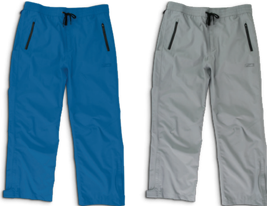
BLUE 1040193000 | BLU

100% Polyester | Lightweight Rainwear Fishing Jacket | Waterproof Ripstop Fabric | Stash-Able Hood | Side Zip Vents | Weld-ed Seams | Zip Hand Pockets