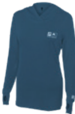
SMOKEY BLUE 2015213010 | SMB