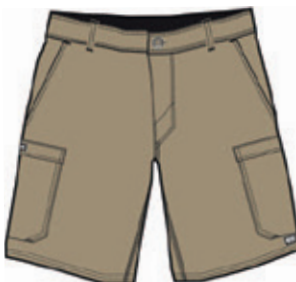
KHAKI 1001213001 | KHA