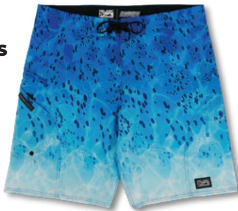
BLUE 3001211005 | BLU