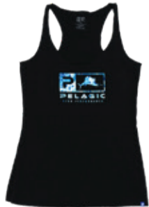
BLACK 2010213000 | BLK