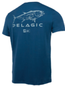
SMOKEY BLUE 1014211000 | SMB

94% Polyester, 6% Spandex | Premium UV Protection | Moisture-Wicking | Modern Fit