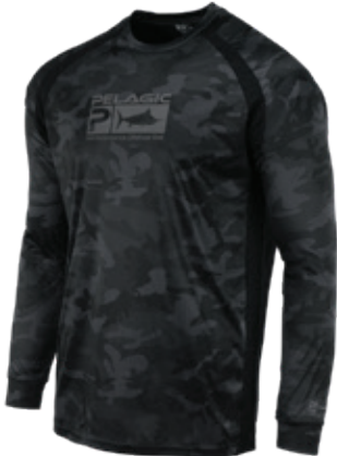
BLACK 3015202004 | | BLK