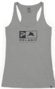
HEATHER GREY 2010213003 | HGY