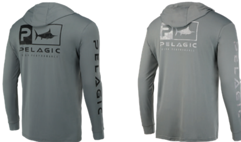
GREY 4015213001 | GRY