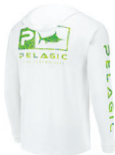
DORADO GREEN 1015211007 | | GRN