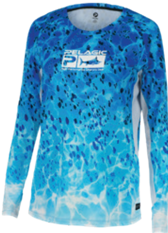
BLUE 2015211007 | BLU