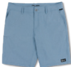
SLATE 3001213003 | SLT