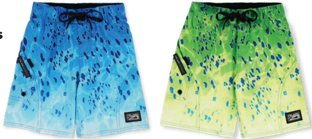
BLUE 4001211005 | BLU