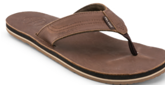
BROWN 1401181001 | BRN