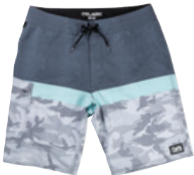
FISH CAMO STACKED - LIGHT GREY 1001202001 | LGY