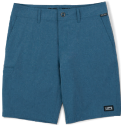
GYOTAKU SMOKEY BLUE 1001211004 | SMB

21” Outseam | 9” Inseam | 4-Way Stretch Fabric | 61% Cation, 20% Nylon, 10% Polyester, 9% Spandex | 5 All-Purpose Storage Pockets | Ultra-Lightweight | Quick Dry | Stain Release Technology