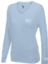
LIGHT BLUE 2015213009 | LBL