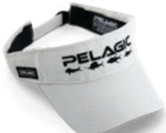
WHITE 1207201000 | WHT