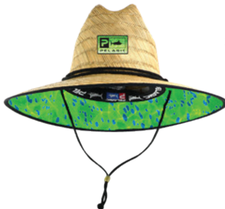
GREEN 1205211000 | GRN