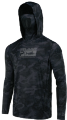
BLACK FISH CAMO 1015202001 | BLK

86% Polyester, 14% Elastane | UPF 50+ Sun Protection | Anti-Microbial | Mesh Side Panels for Ventilation | Vented Mesh Hoodie | Quick Drying