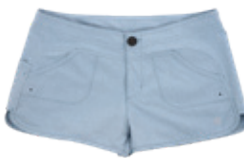
SLATE 2001213000 | SLT