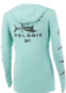
TURQUOISE 2015211005 | TUR