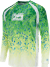
GREEN 4015211008 | GRN