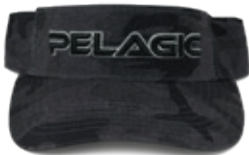
BLACK 1207201003 | BLK