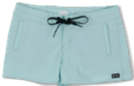
TURQUOISE 2001211001 | TUR