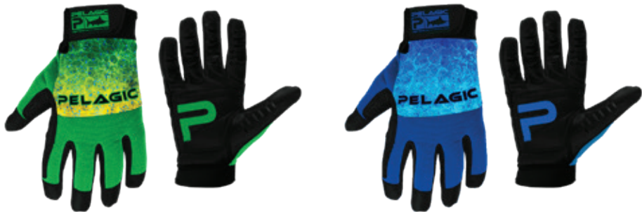
GREEN 1250191000 | GRN

Smart Touch - Touchscreen Capable | Kevlar Reinforced | Closed Fingertips for Maximum Protection | Suregrip Technology | Adjustable Velcro Closure