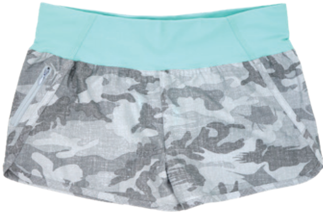
LIGHT GREY 2031202001 | LGY

Stretch Flex Fabric | 92% Polyester | 8% Elastane | Quick Dry | 2 All-Purpose Pockets | Stain-Repel Technology