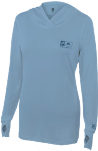
SLATE 2015213010 | SLT

50+ Protection | Stretch Flex 100% Nylon | Stain-Repel Technology | Hydro-Repel Coating | Quick-Drying