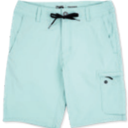
TURQUOISE 1001201015 | TUR