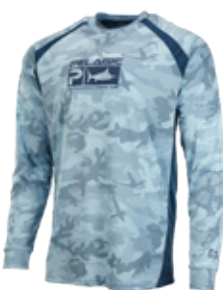
SLATE 1015202004 | SLT