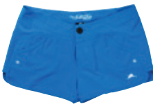
ROYAL 2001181005 | RYL