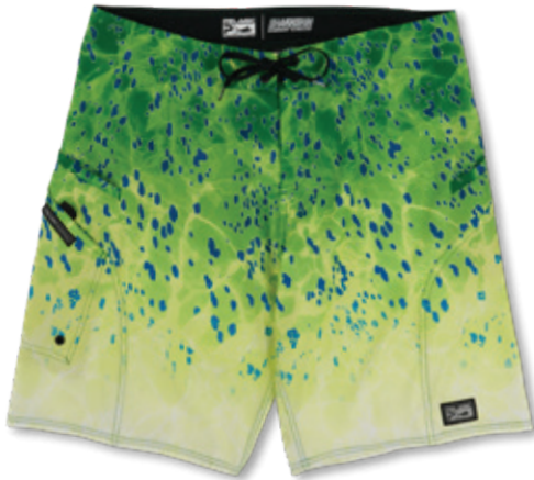
GREEN 3001211005 | GRN