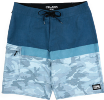
SLATE 3001202001 | SLT