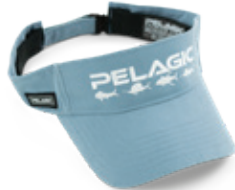
SMOKEY BLUE 1207201000 | SMB