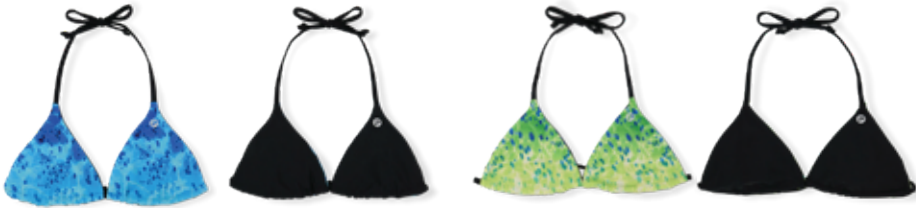
BLUE 2301211001 | BLU