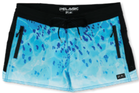
BLUE 2001211001 | BLU