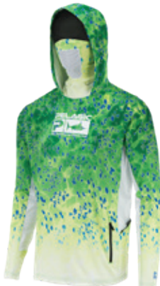
DORADO GREEN 1015211009 | GRN