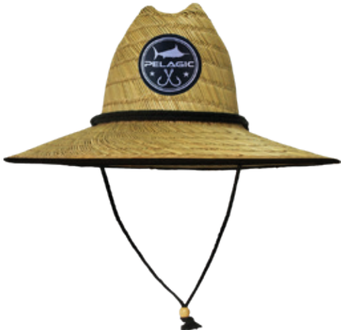
KHAKI 1205181002 | KHA