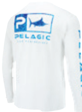
BLUE 3015211006 | BLU