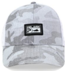
WHITE 1203202000 | WHT