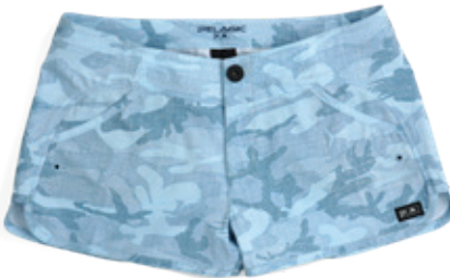
SLATE 2001203000 | SLT