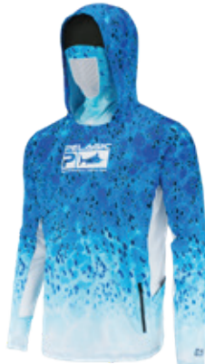
DORADO BLUE 1015211009 | BLU