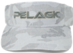
LIGHT GREY 1207201003 | LGY