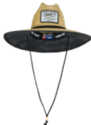
BLACK 1205213000 | BLK