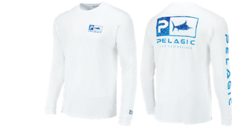
DORADO BLUE 1015211006 | BLU

Upf 50+ L/S Fishing Shirt | 100% Nylon | Water Repellency And Stain Guard | Anti-Microbial | Vented Underarm