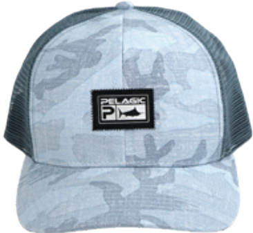
SLATE 1202213008 | SLT