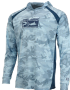
SLATE 1015213003 | SLT