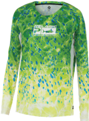
GREEN 2015211007 | GRN