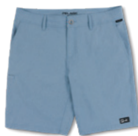
SLATE 1001213003 | SLT