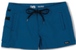
SMOKEY BLUE 2001211001 | SMB

Stretch Flex Fabric | 92% Polyester | 8% Elastane | Quick Dry | 2 All-Purpose Pockets | Stain-Repel Technology