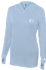
LIGHT BLUE 2015213010 | LBL