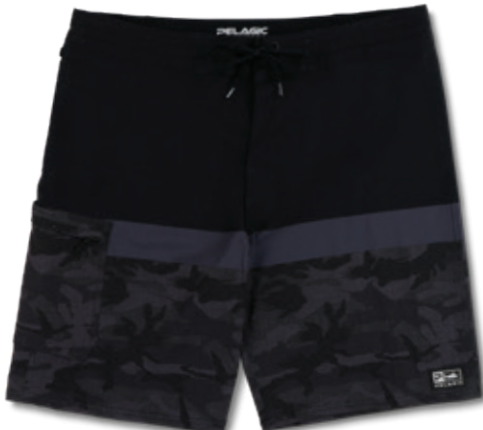
BLACK 3001213000 | BLK