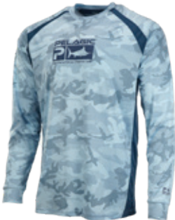
SLATE 3015202004 | | SLT