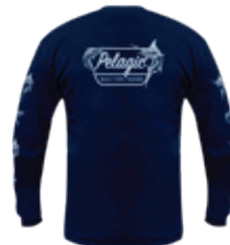
NAVY 1173213003 | NVY