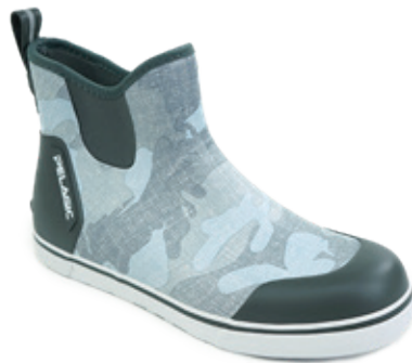
LIGHT GREY 1430201002 | LGY