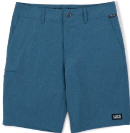
SMOKEY BLUE 3001211004 | SMB