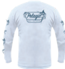
WHITE 1173213003 | WHT