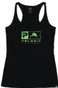
BLACK 2010213001 | BLK