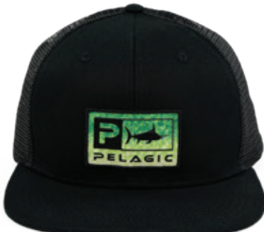
BLACK 1202211001 | BLK