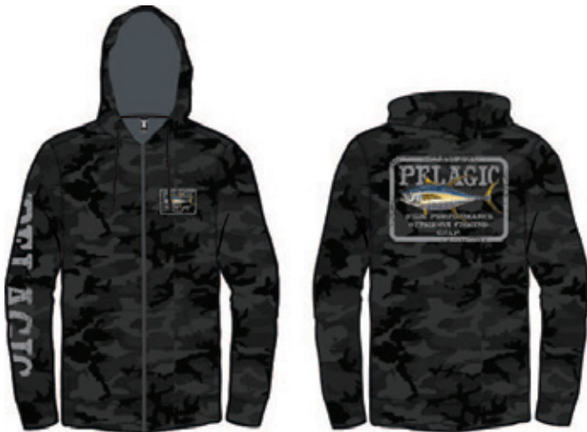
BLACK 1061213003 | BLK