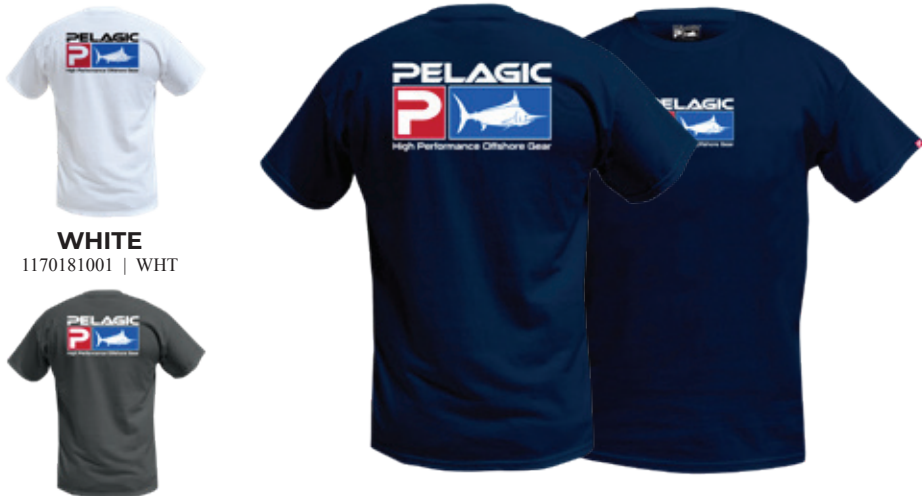
CHARCOAL 1170181001 | CHR