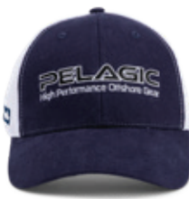
NAVY 1203181001 | NVY