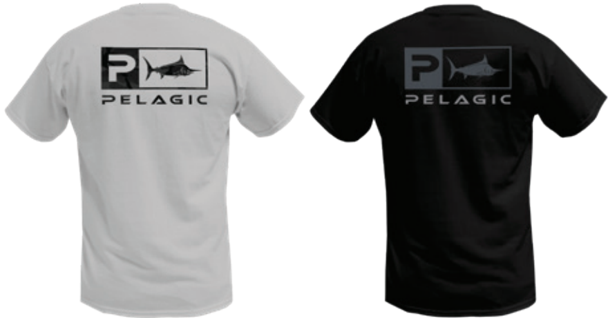
LIGHT GREY 1171213000 | LGY

100% Cotton | Soft Hand Feel | Modern Fit | Pre-Shrunk Material | Ultra-lightweight