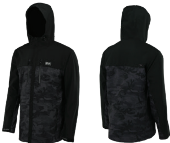
BLACK 1051203000 | BLK