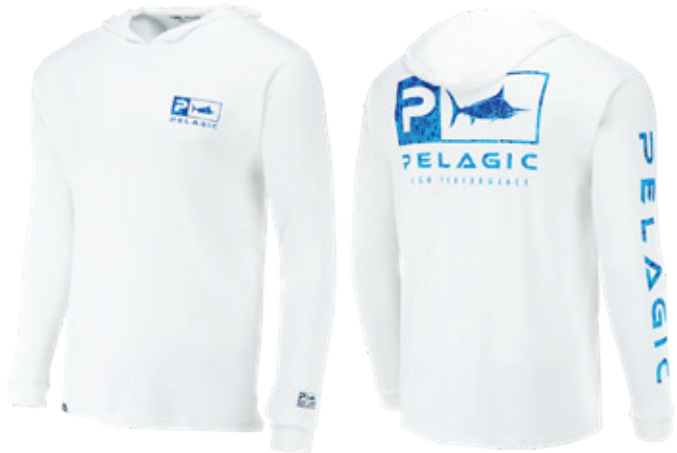
DORADO BLUE 1015211007 | | BLU

Upf 50+ L/S Fishing Shirt | 100% Nylon | Water Repellency And Stain Guard | Anti-Microbial | Vented Underarm