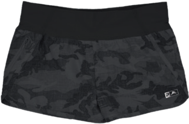
BLACK 2032213000 | BLK