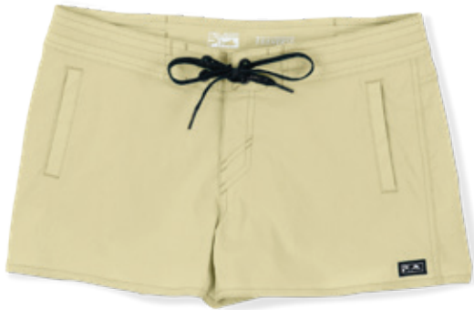
KHAKI 2001211015 | KHA