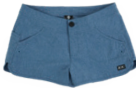
SMOKEY BLUE 2001211004 | SMB