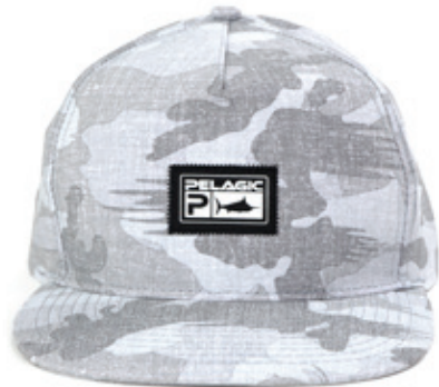
LIGHT GREY 1202202001 | LGY