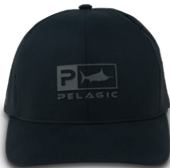
BLACK 1201213000 | BLK