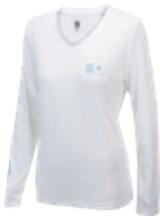
WHITE 2015213009 | WHT