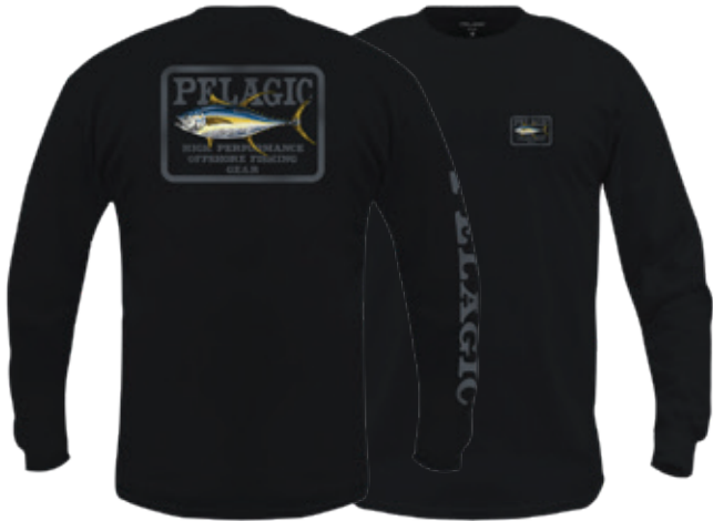
BLACK 1173213002 | BLK