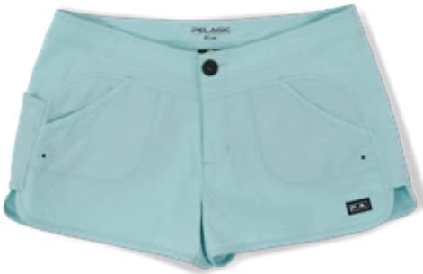
TURQUOISE 2001211004 | TUR