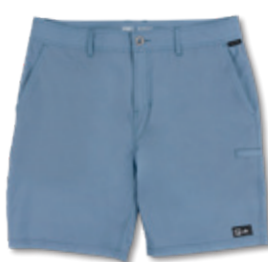
SLATE 1001213002 | SLT