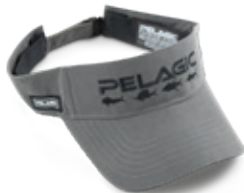
CHARCOAL 1207201000 | CHR