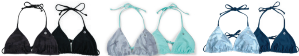
BLACK 2301202001 | BLK