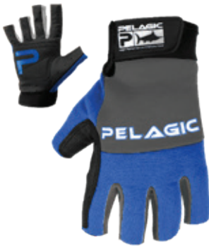
ROYAL MGL9910 | RYL

Kevlar Lined | Adjustable Tightening Strap | Lightweight Fabric | Moisture Wicking Properties | Performance Sweatband