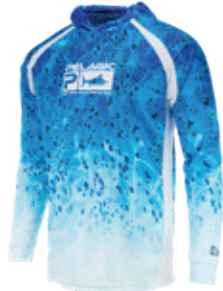
BLUE 1015213004 | BLU