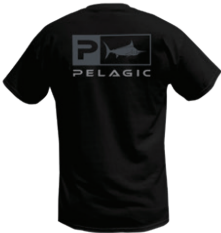
BLACK 3170213000 | BLK