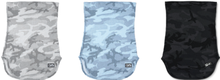
LIGHT GREY 1220211000 | LGY