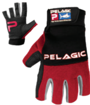
RED MGL9910 | RED