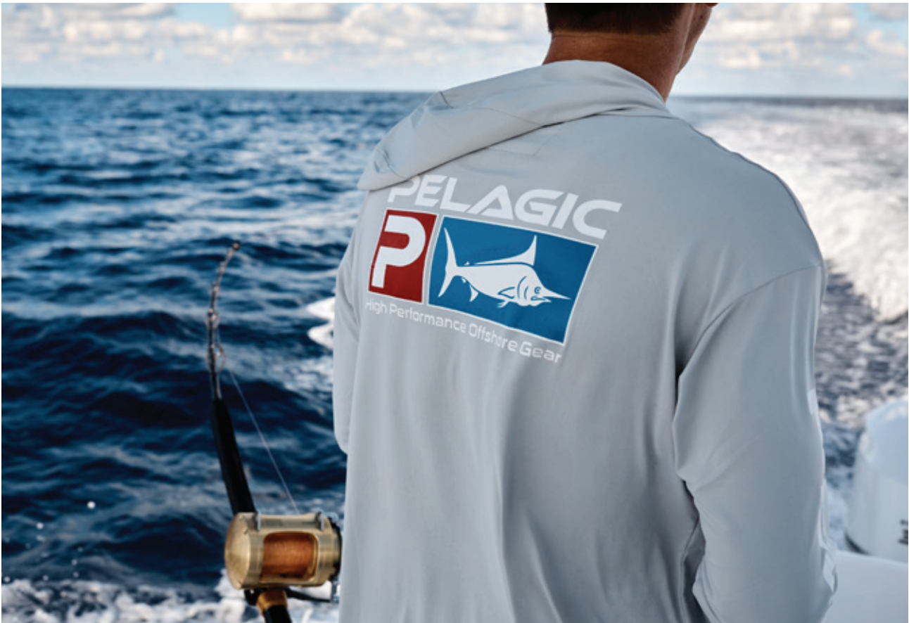
NAVY 1015211000 | NVY