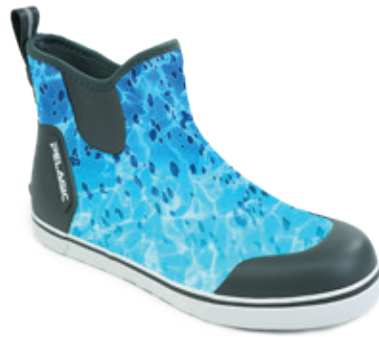
BLUE 1430201000 | BLU