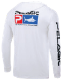
WHITE 1015211001 | WHT