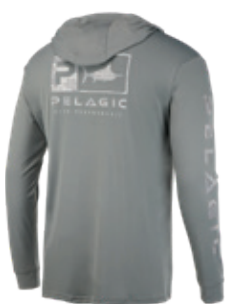
CHARCOAL 1015211002 | CHR