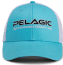
LIGHT BLUE 1203181001 | LBL