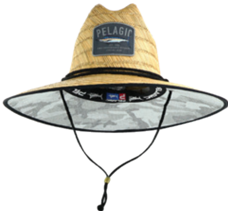
LIGHT GREY 1205202000 | LGY