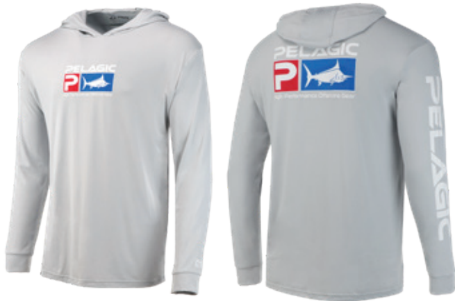
LIGHT GREY 1015211001 | LGY

86% Polyester, 14% Elastane | UPF 50+ Sun Protection | Anti-Microbial | Mesh Side Panels for Ventilation | Vented Mesh Hoodie | Quick Drying