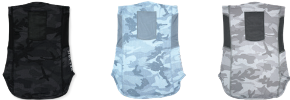
BLACK 1221202001 | BLK