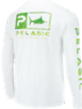
GREEN 3015211006 | GRN