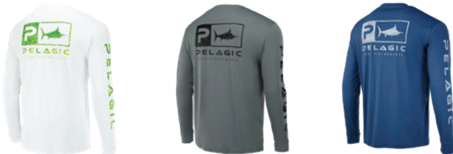
DORADO GREEN 1015211006 | GRN