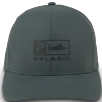
DARK GREY 1201213000 | GRY