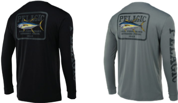
BLACK 1015213000 | BLK

UPF 50+ Sun Protection | 100% Nylon Stretch-Flex Fabric | Hydro-Repel | Anti-Microbial | Stain-Repel Technology | Ventilated Airflow | Loose Cut for Ultimate Comfort