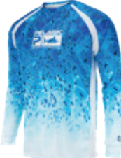
BLUE 4015211008 | BLU