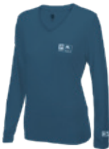
SMOKEY BLUE 2015213009 | SMB