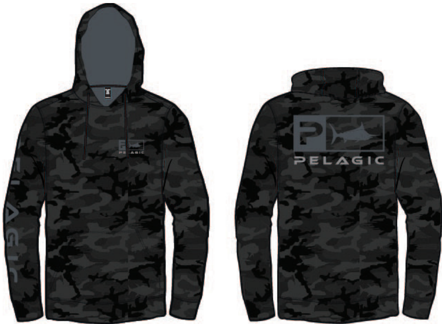
BLACK 2061213000 | BLK