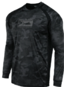
BLACK FISH CAMO 1015202004 | | BLK