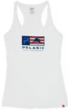
WHITE 2010213002 | WHT