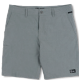
GREY 1001213003 | GRY