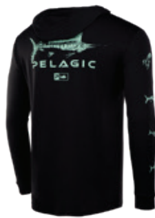
BLACK 1015211005 | BLK