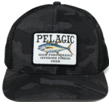
BLACK 1202213000 | BLK