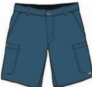
SMOKEY BLUE 1001213001 | SMB