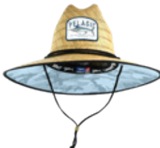
SLATE 1205202000 | SLT