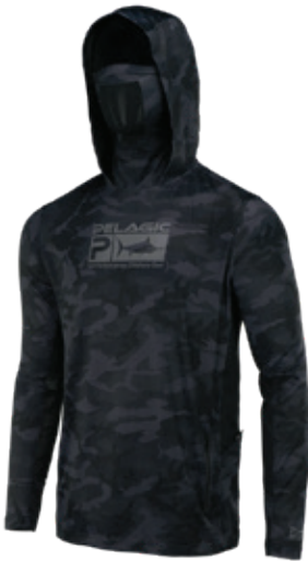
BLACK 3015213003 | BLK