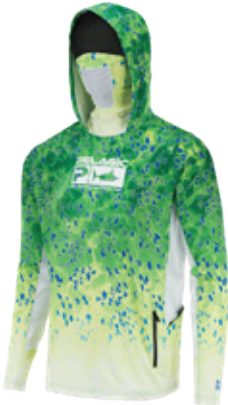
GREEN 3015211009 | GRN