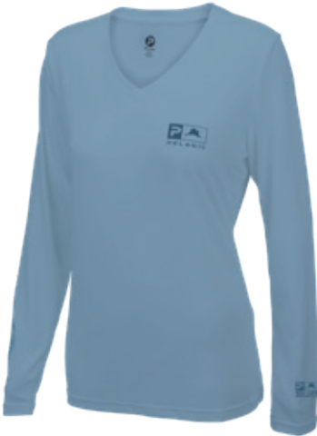
SLATE 2015213009 | SLT

Stretch Flex Fabric | 92% Polyester | 8% Elastane | Quick Dry | 2 All-Purpose Pockets | Stain-Repel Technology