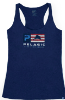
NAVY 2010213002 | NVY