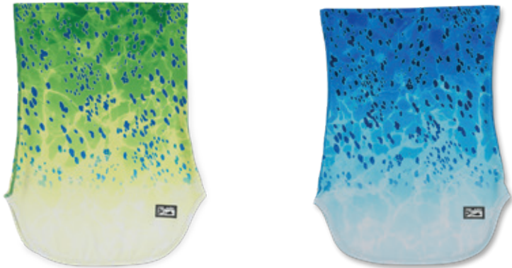
GREEN 1220211003 | GRN