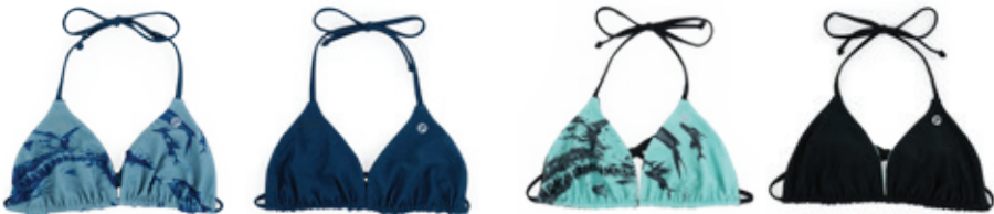
SMOKEY BLUE 2301211000 | SMB