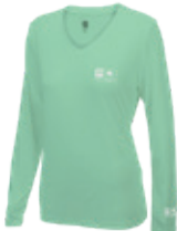
TURQUOISE 2015213009 | TUR