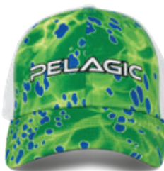
GREEN 1203213000 | GRN