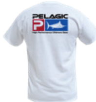
WHITE 3170191002 | WHT