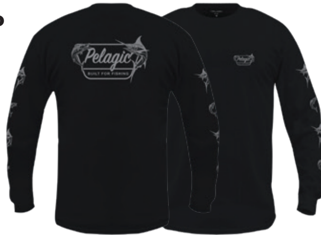
BLACK 1173213003 | BLK