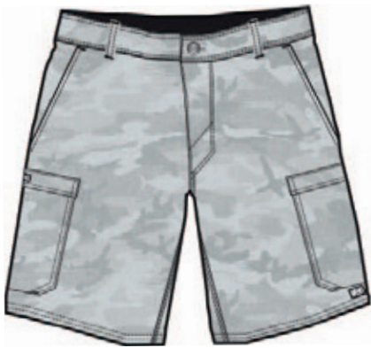
FISH CAMO - LIGHT GREY 1001213000 | LGY