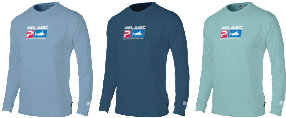
SLATE 1015181021 | SLT

UPF 50+ Sun Protection | 100% Nylon Stretch-Flex Fabric | Hydro-Repel | Anti-Microbial | Stain-Repel Technology | Ventilated Airflow | Loose Cut for Ultimate Comfort