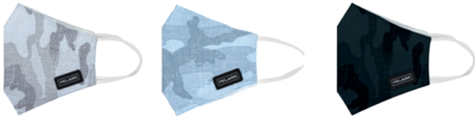
LIGHT GREY 1223213000 | LGY