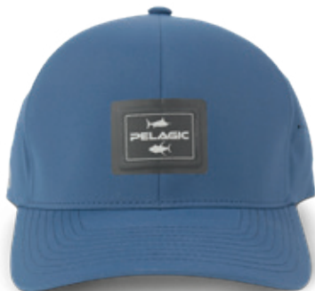
SMOKEY BLUE 1201201000 | SMB