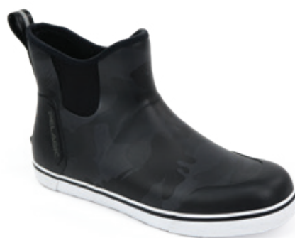
BLACK 1430201002 | BLK