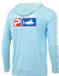
LIGHT BLUE 1015211001 | LBL