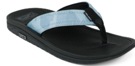
SLATE 1420211000 | SLT