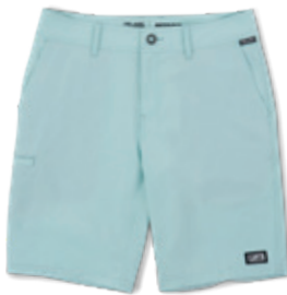
GYOTAKU TURQUOISE 1001211004 | TUR