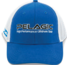
BLUE 1203181001 | BLU