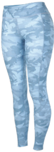
SLATE 2041202001 | SLT