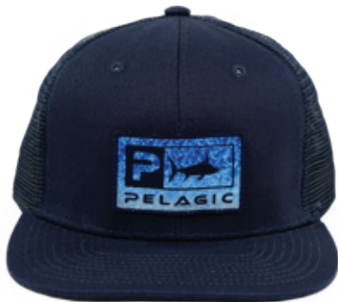
NAVY 1202211001 | NVY