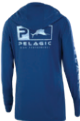
SMOKEY BLUE 2015211000 | SMB