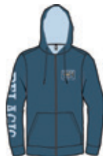
SMOKEY BLUE 1061213002 | SMB