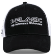
BLACK 1203181001 | BLK