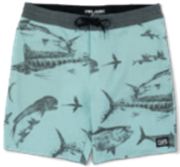
GYOTAKU TURQUOISE 1001211003 | TUR