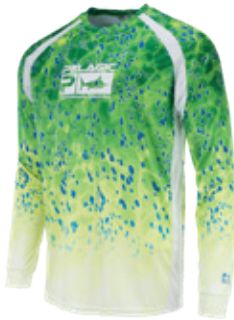
GREEN 3015211008 | GRN