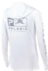
WHITE 2015202001 | WHT

UPF 30+ Protection | Stretch Flex 100% Nylon | Stain-Repel Technology | Hydro-Repel Coating | Quick-Drying