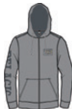
GREY 1061213002 | GRY