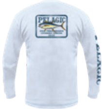
WHITE 1173213002 | WHT