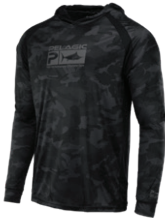
BLACK FISH CAMO 1015213003 | BLK