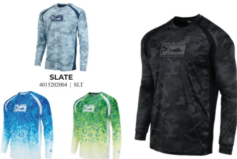
CHARCOAL 4015211002 | CHR