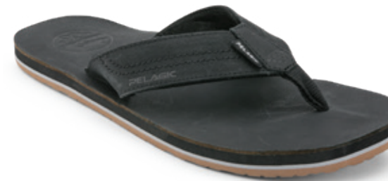
BLACK 1401181001 | BLK

Genuine Leather | Non-Slip No-Mark Boat Sole | Pelagic Hooks Logo Stamped Heel