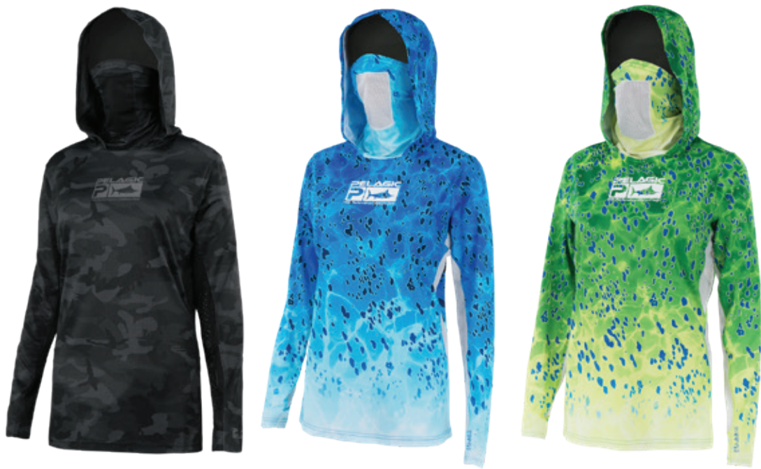
BLACK 2015213001 | BLK