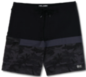
FISH CAMO STACKED - BLACK 1001202001 | BLK