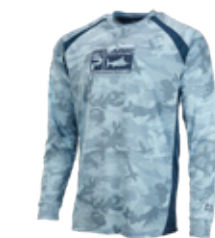
SLATE 4015202004 | SLT