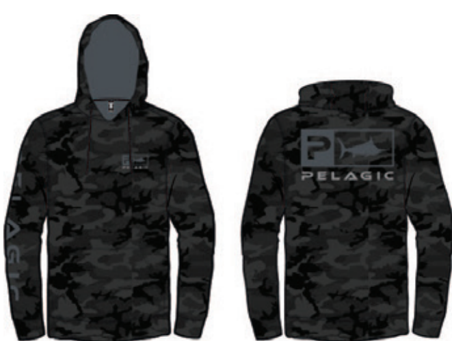
BLACK 1061213001 | BLK