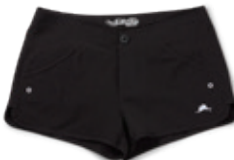
BLACK 2001181005 | BLK