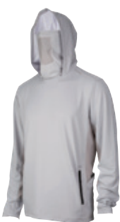
LIGHT GREY 1015202002 | LGY