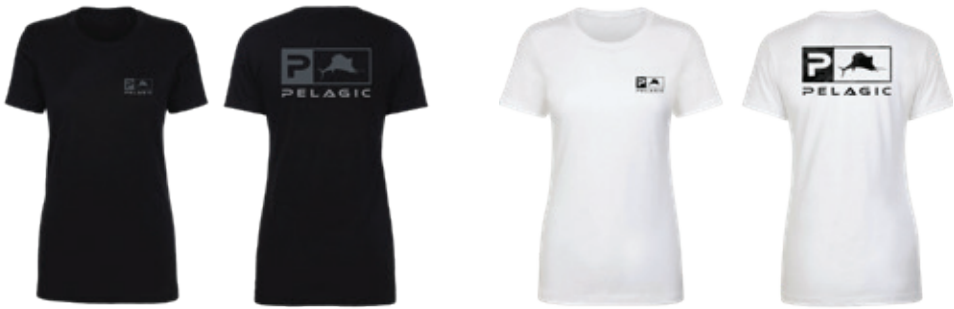
BLACK 2170213000 | BLK