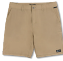
KHAKI 1001213002 | KHA