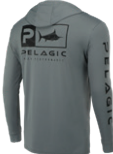
GREY 1015213002 | GRY