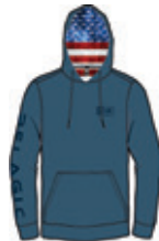
SMOKEY BLUE 1061213000 | SMB