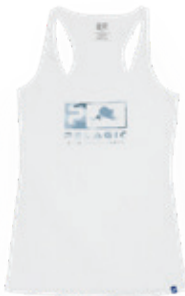
WHITE 2010213004 | WHT