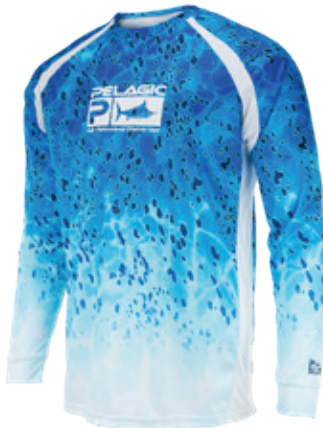
DORADO BLUE 1015211008 | | BLU

UPF 50+ Sun Protection | 100% Nylon Stretch-Flex Fabric | Hydro-Repel | Anti-Microbial | Stain-Repel Technology | Ventilated Airflow | Loose Cut for Ultimate Comfort