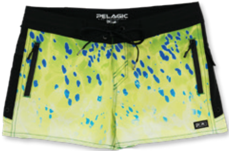
GREEN 2001211001 | GRN