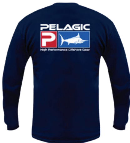
NAVY 1173201001 | NVY