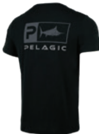
BLACK 1014213000 | BLK

It's your second skin! Part sunshirt, part fishing shirt, part hoody, part fishing face mask – the Pelagic Exo-Tech is the ultimate force-field from the sun's harmful and damaging UV rays. Packed to the gills with features, this tech shirt has everything you would ever need for a long, sunburn free day on the water.