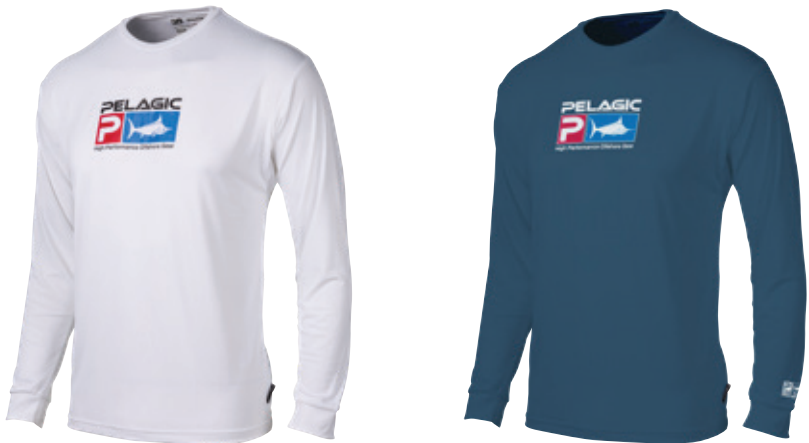
WHITE 4015213002 | WHT