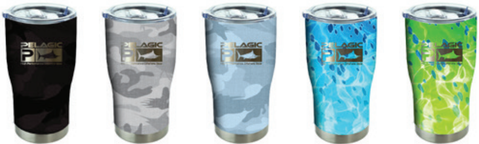
BLACK 1264201001 | BLK