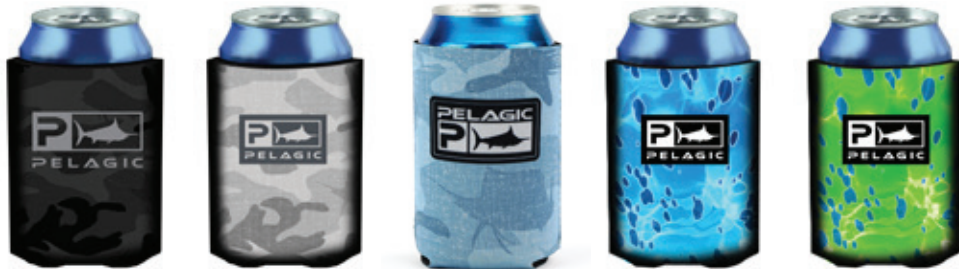
BLACK 1261201000 | BLK

Kevlar Lined | Adjustable Tightening Strap | Lightweight Fabric | Moisture Wicking Properties | Performance Sweatband