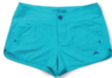
AQUA 2001181005 | AQU