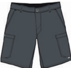
GRAPHITE 1001213001 | GRA