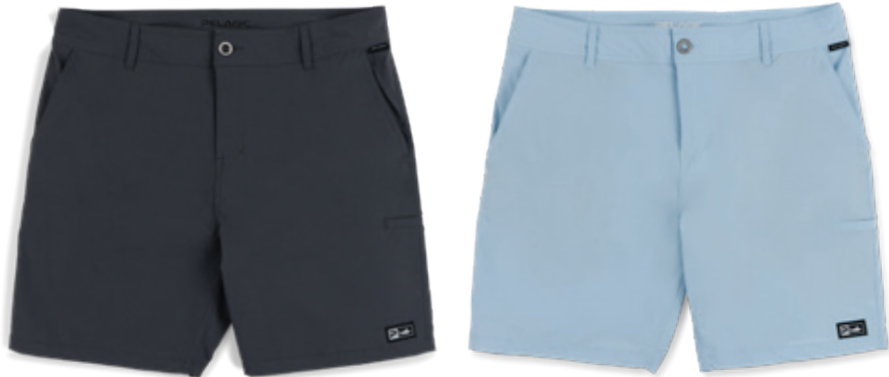
GRAPHITE 1001213004 | GRA

Modern Fit Hybrid Walkshort | 19” Outseam | Ultra-Plush 4-Way Stretch Fabric with Repreve® Recycled Fibers | Mesh-Lined Front Hand Pockets | Back Flap Pockets | Side Utility/Cell Phone Pocket | Belt Loops