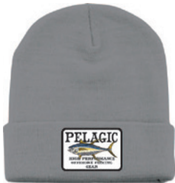
GREY 1210213000 | GRY