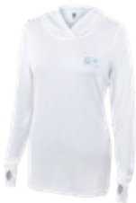
WHITE 2015213010 | WHT