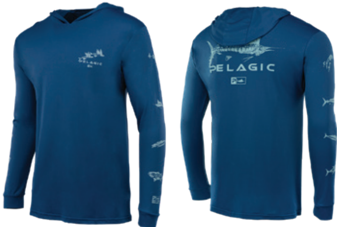
SMOKEY BLUE 1015211005 | | SMB