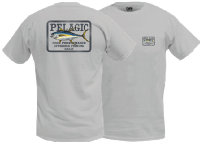
LIGHT GREY 3170213001 | LGY