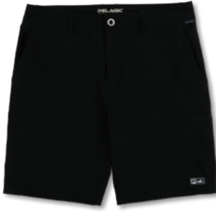
BLACK 1001213002 | BLK