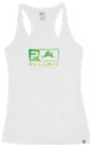
WHITE 2010213001 | WHT