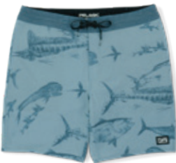
GYOTAKU SLATE 1001211003 | SLT