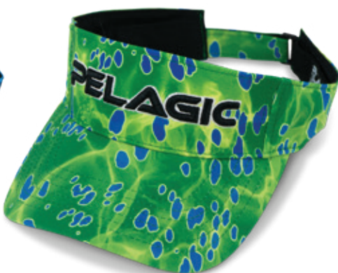
GREEN 1207211000 | GRN