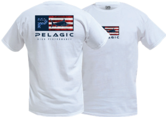
WHITE 3170201003 | WHT