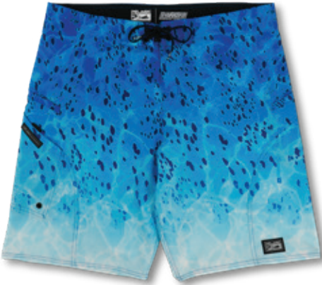
DORADO BLUE 1001211005 | BLU