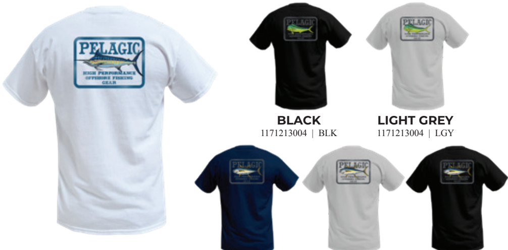
WHITE 1171213003 | WHT