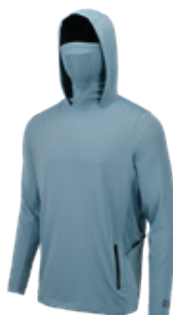
SLATE 1015201007 | SLT