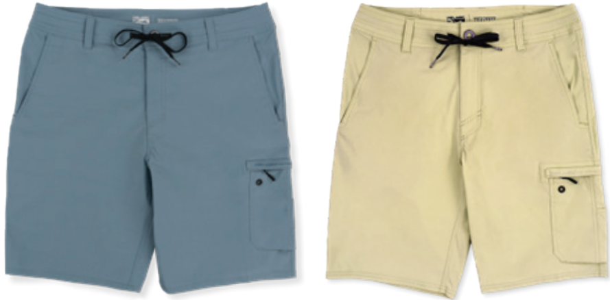
SLATE 1001201015 | SLT

21” 2 Way Stretch Fishing Short | 65% Nylon | 5% Elastane | Water Repellency And Stain Guard | Tightlines™ Adjustable Waistband | Left Side Cargo Pocket | Right Side Double-Stack Reinforced Tool & Accessory Pocket | Mesh Lined Front Hand Pockets & Back Zip Pocket