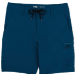
SMOKEY BLUE 1001201015 | SMB