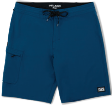
GYOTAKU SMOKEY BLUE 1001211002 | SMB