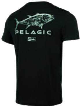
BLACK 1014211000 | BLK