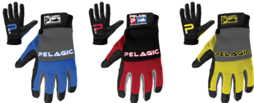
ROYAL MGL9920 | RYL

Kevlar Reinforced | Closed Fingertips for Maximum Protection | Suregrip Technology | Adjustable Velcro Closure