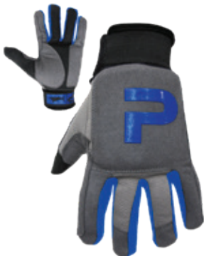
GREY / ROYAL MGL9930 | GRO

Kevlar Lined | Adjustable Tightening Strap | Lightweight Fabric | Moisture Wicking Properties | Performance Sweatband