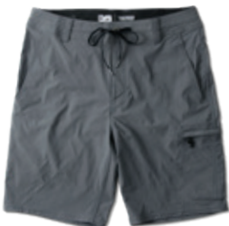
CHARCOAL 1001201015 | CHR