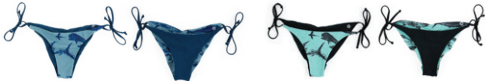
SMOKEY BLUE 2320211000 | SMB