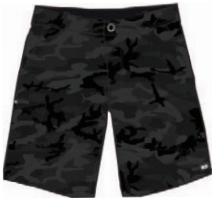
BLACK FISH CAMO 1001213000 | BLK

20” Traverse Fit | Left Side Water Proof Zipper Cargo Pocket | Right Side Tool Pocket | Right Side Cargo Pocket No Zip | Back Welt Patch Pockets | Tight Lines