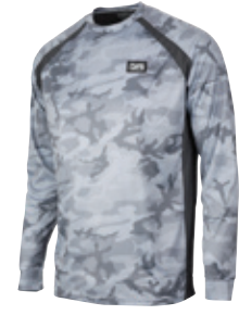
LIGHT GREY 1015202004 | LGY