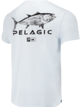
WHITE 1014211000 | WHT